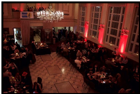
The Big Event 2018: The Gala