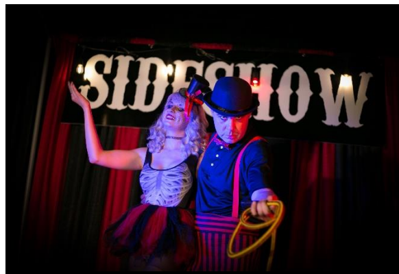
The Big Event 2019: The Night Carnival